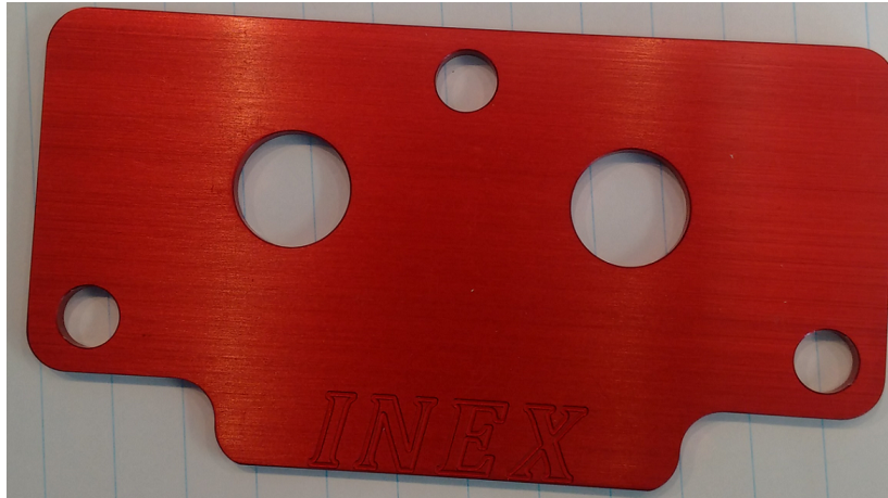
½ inch opening red restrictor plate