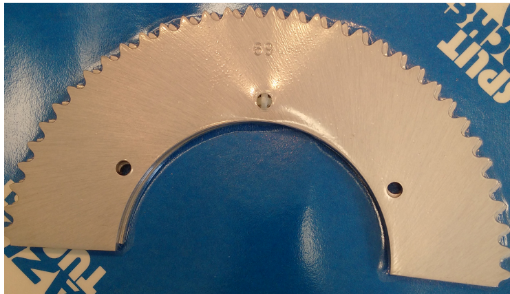
69 Tooth Sprocket Gear